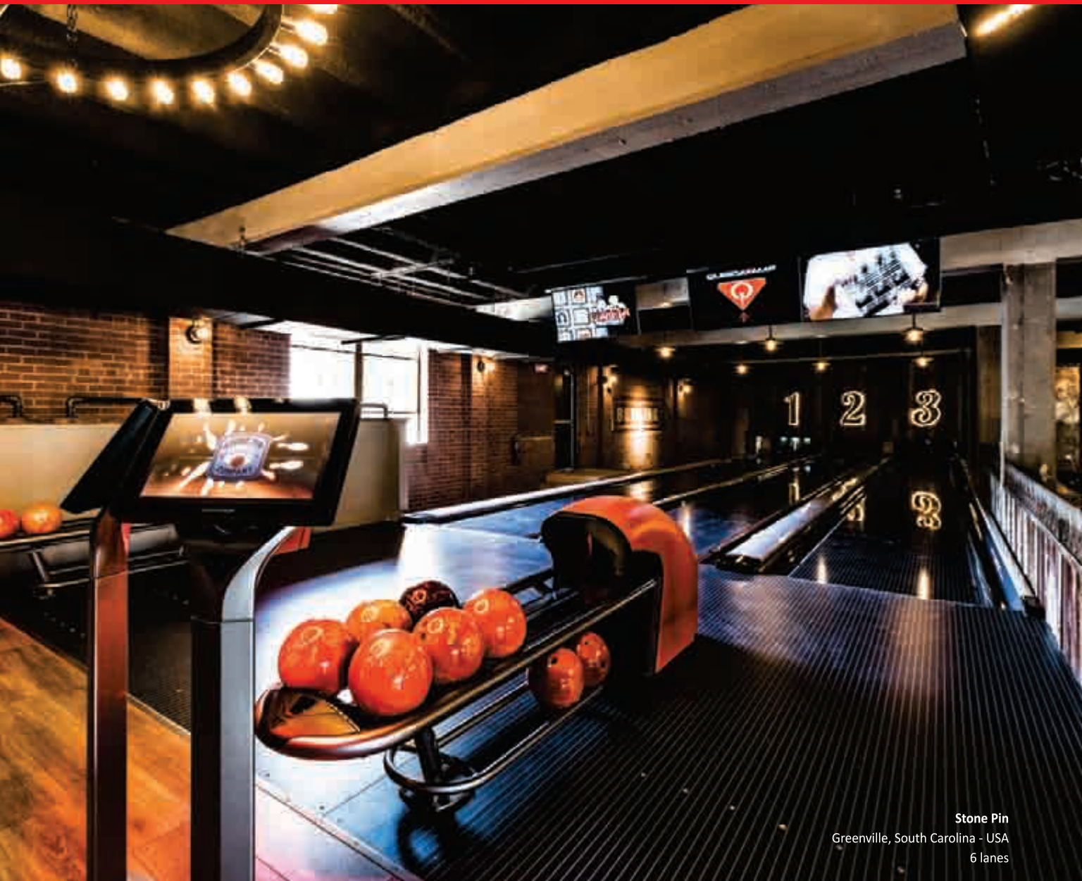
Stone Pin Greenville, South Carolina - USA 6 lanes