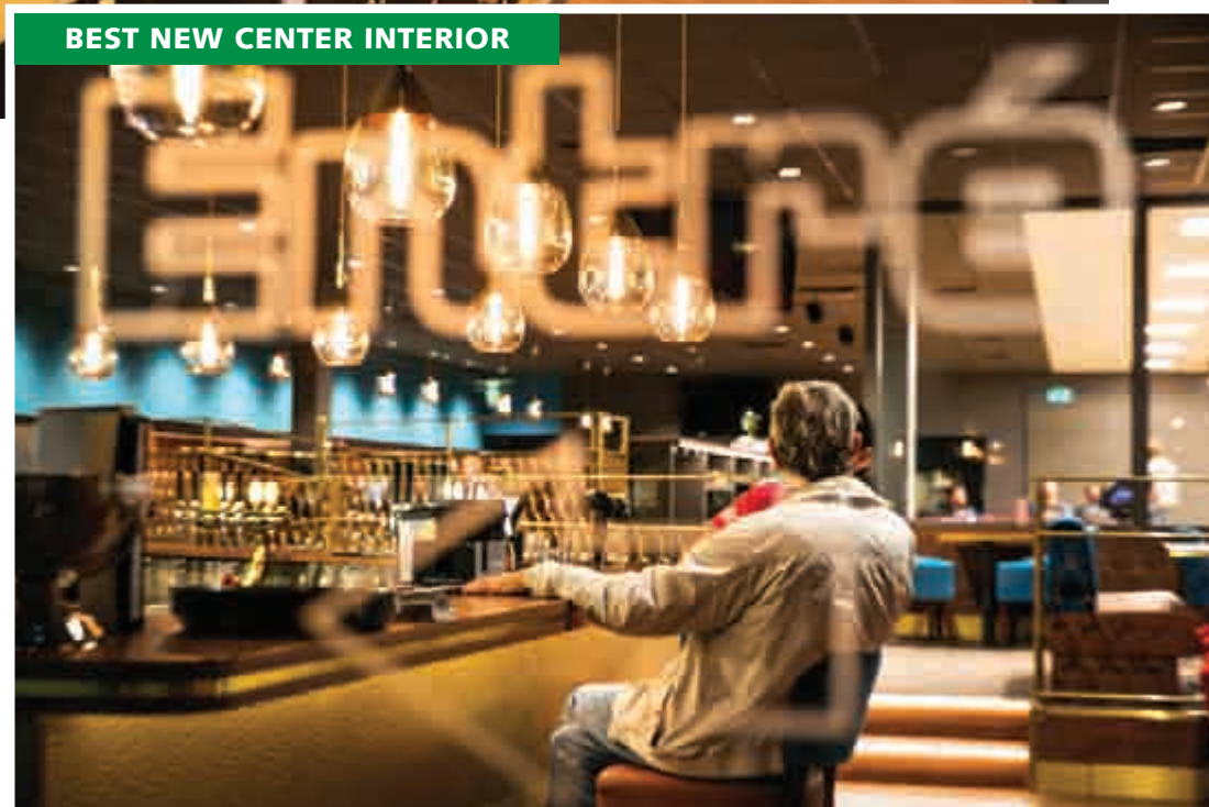
BEST NEW CENTER INTERIOR