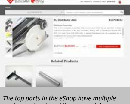
The top parts in the eShop have multiple angles, and we're adding more pictures each day.