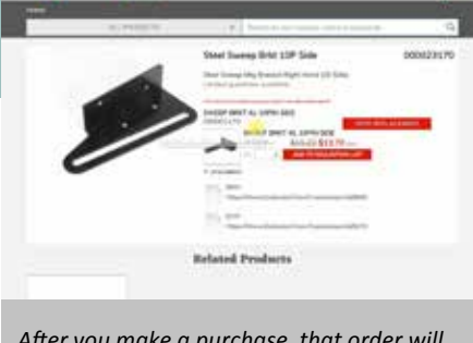
After you make a purchase, that order will be in your history for the next time you need it.

Photos make all the difference when you're ordering online. Can you imagine ordering on Amazon without a picture of the tools you're going to buy? We're making sure you have access to thousands of photos so you know you're ordering the right part, every time.