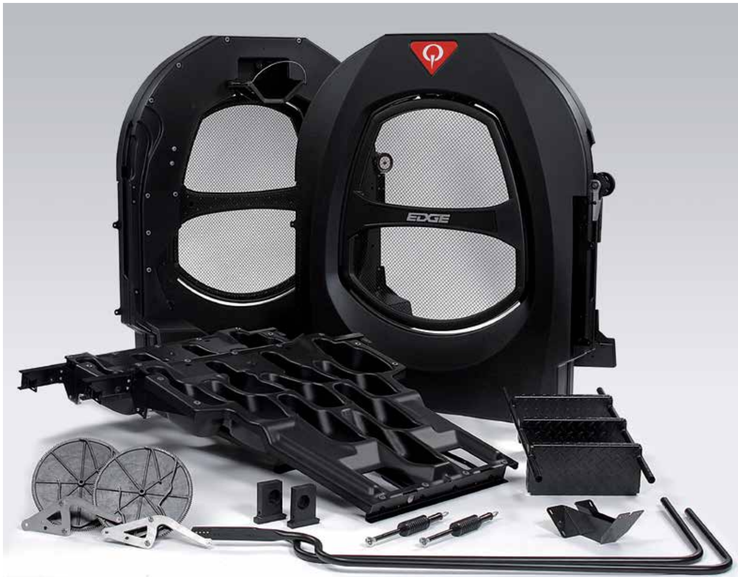
EDGE Pinspotter Upgrade with Durabin - Upgrade Contents