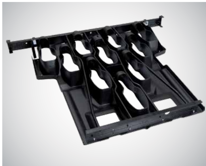
Steel Support Frame