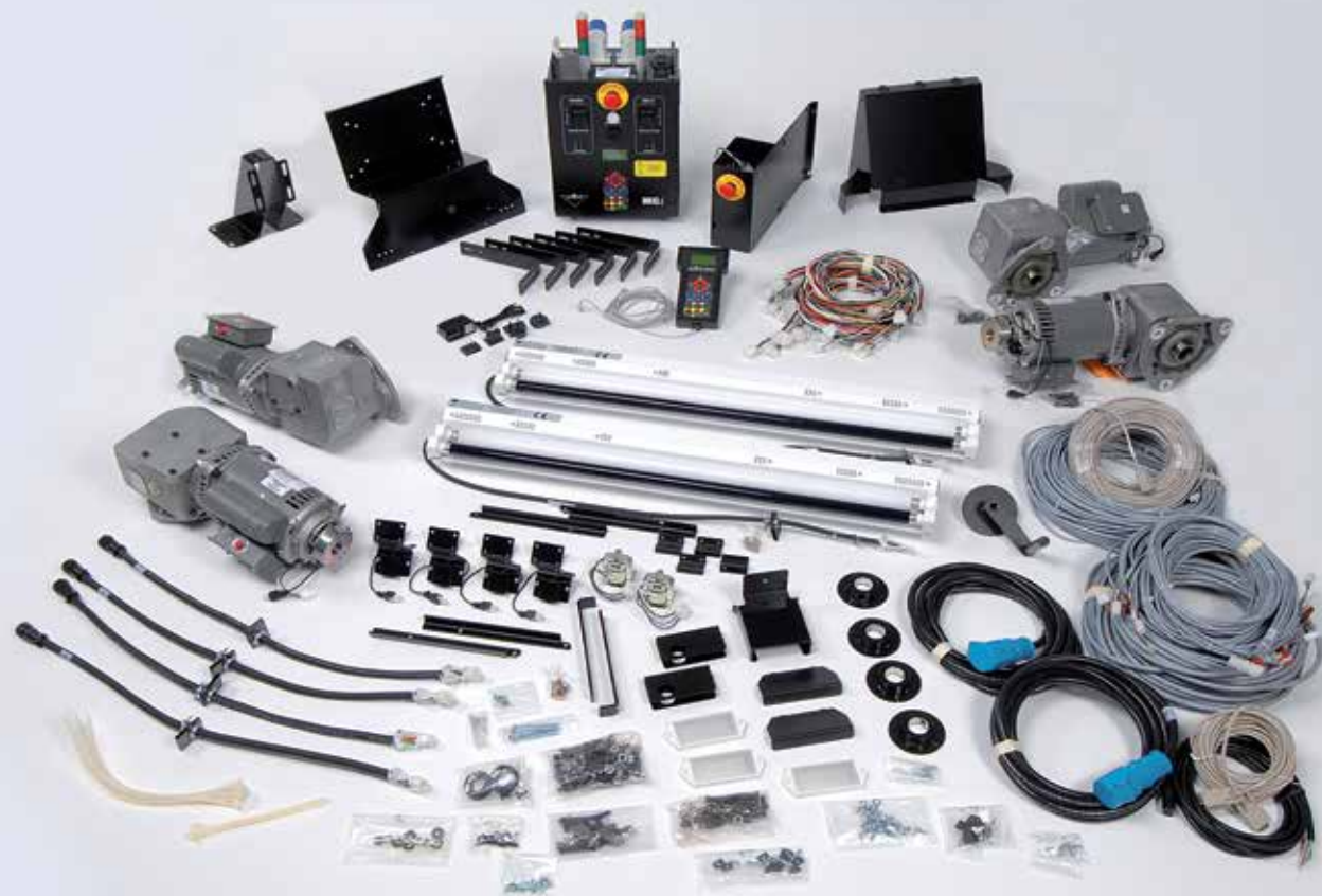
XLi Pinspotter Upgrade for 82-90 Pinspotters - Upgrade Contents