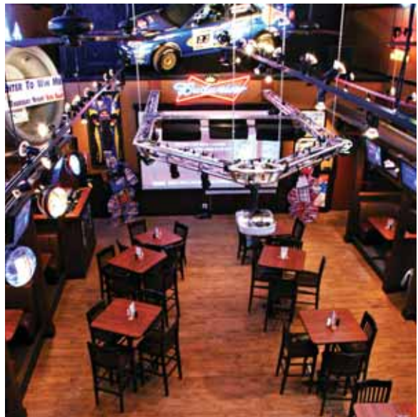
Bar signage out front reads: "Good Food – Good People – Good Sports." Decor includes an 850-pound bear shot by Bowl New England CEO Dick Corley and trophies supplied by local hunters.