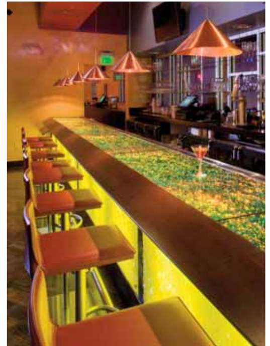
The Lift, a grill and lounge with 40+ items on an eclectic menu.